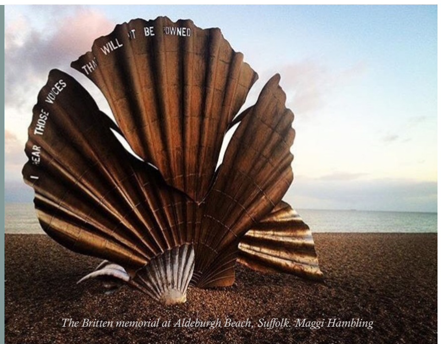
The Britten memorial at Aldeburgh Beach, Suffolk. Maggi Hambling