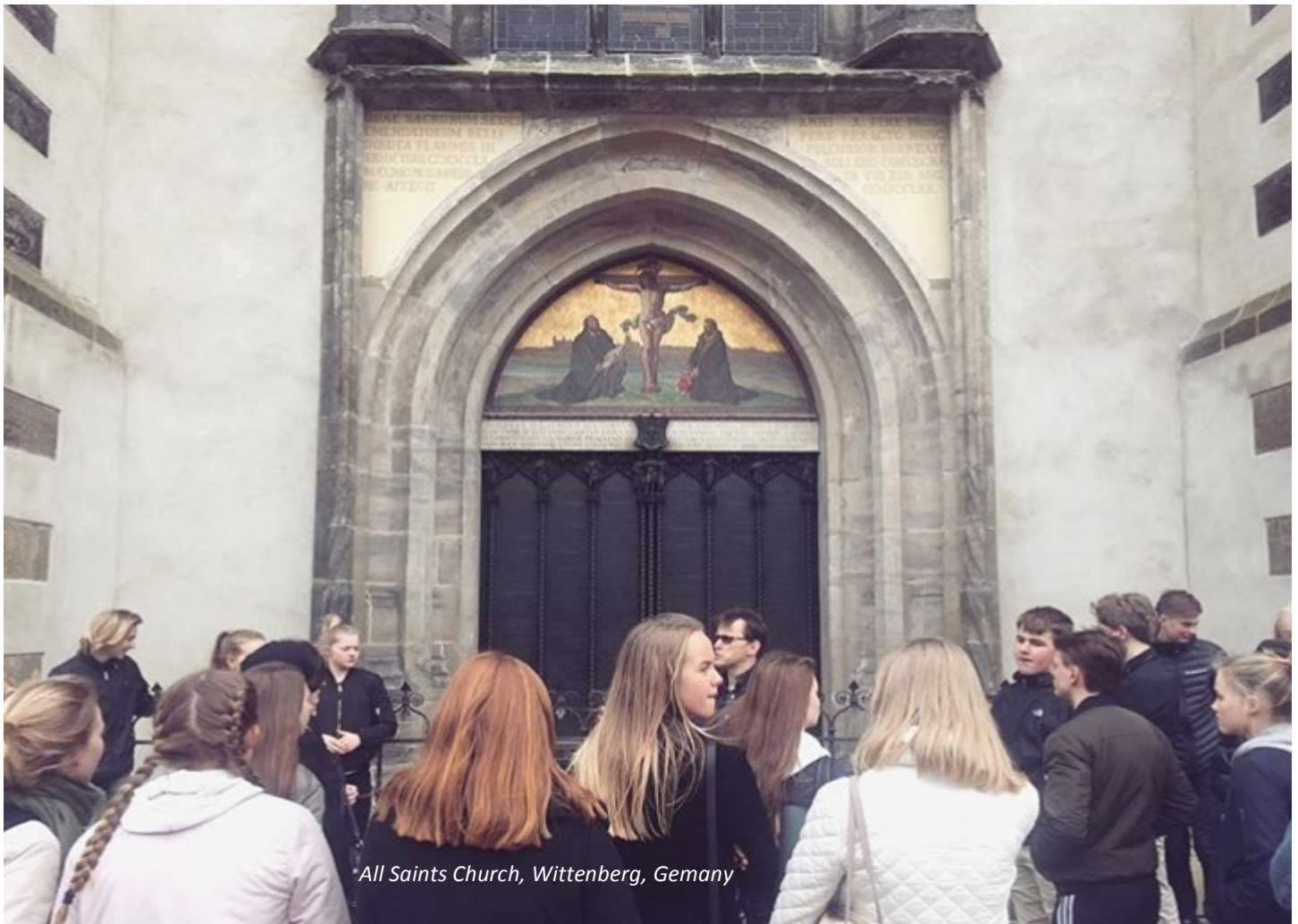
All Saints Church, Wittenberg, Germany

We are grateful to Otherworld Press who have agreed to publish this Pamphlet.