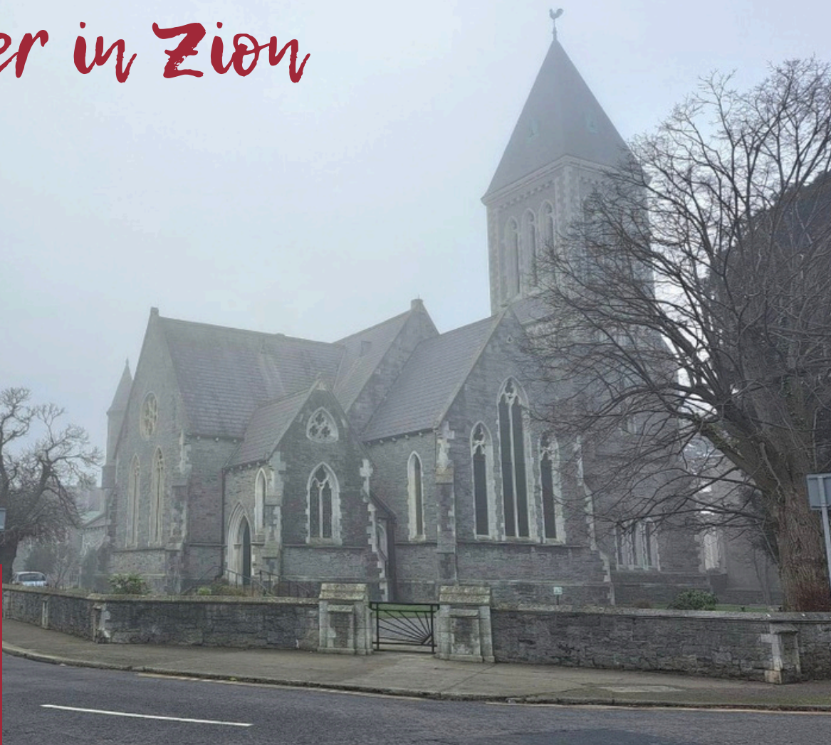
Young European Strings Concert in the Church on Saturday 14th December